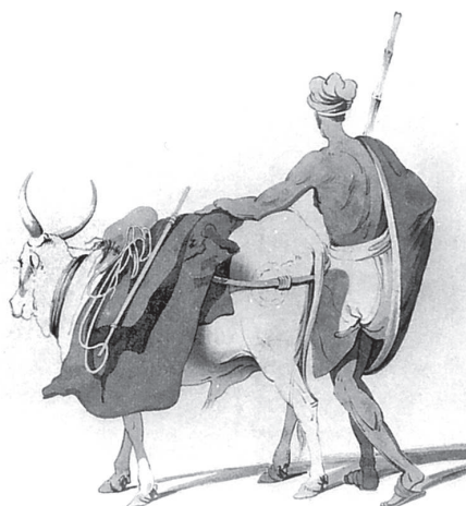
Fig. 5.11 Drawings such as this nineteenth-century example often reinforced the notion of an unchanging rural society.

As an extension of this, Bernier described Indian society as consisting of undifferentiated masses of impoverished people, subjugated by a small minority of a very rich and powerful ruling class. Between the poorest of the poor and the richest of the rich, there was no social group or class worth the name. Bernier confidently asserted: "There is no middle state in India."