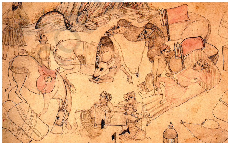
Fig. 5.14 A painting depicting travellers at rest