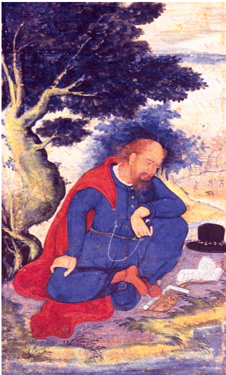
Fig. 5.6 A seventeenth-century painting depicting Bernier in European clothes