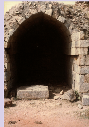
Fig. 5.8 (top) An arch in Tughlakabad, Delhi

The city of Dehli covers a wide area and has a large population ... The rampart round the city is without parallel. The breadth of its wall is eleven cubits; and inside it are houses for the night sentry and gatekeepers. Inside the ramparts, there are store-houses for storing edibles, magazines, ammunition, ballistas and siege machines. The grains that are stored (in these ramparts) can last for a long time, without rotting ... In the interior of the rampart, horsemen as well as infantrymen move from one end of the city to another. The rampart is pierced through by windows which open on the side of the city, and it is through these windows that light enters inside. The lower part of the rampart is built of stone; the upper part of bricks. It has many towers close to one another. There are twenty eight gates of this city which are called darwaza , and of these, the Budaun darwaza is the greatest; inside the Mandwi darwaza there is a grain market; adjacent to the Gul darwaza there is an orchard ... It (the city of Dehli) has a fine cemetery in which graves have domes over them, and those that do not have a dome, have an arch, for sure. In the cemetery they sow flowers such as tuberose, jasmine, wild rose, etc.; and flowers blossom there in all seasons.