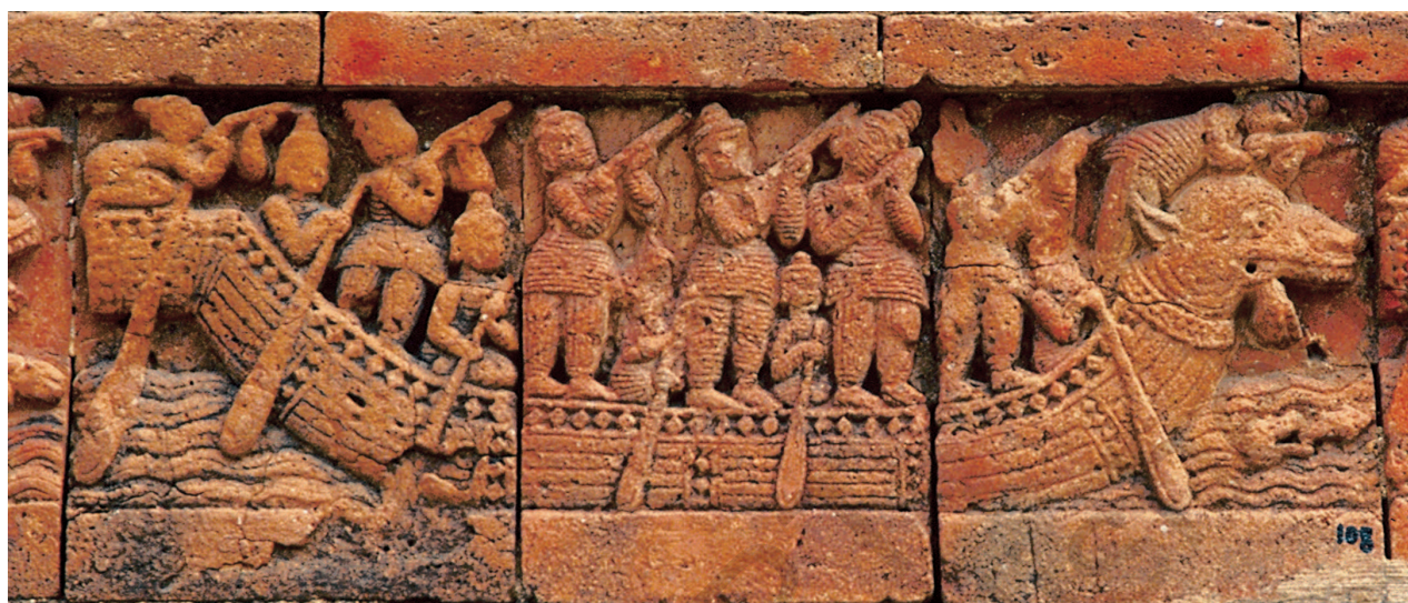
Fig. 5.4 A boat carrying passengers, a terracotta sculpture from a temple in Bengal (c. seventeenth-eighteenth centuries)

Zaytun (now known as Quanzhou). He travelled extensively in China, going as far as Beijing, but did not stay for long, deciding to return home in 1347. His account is often compared with that of Marco Polo, who visited China (and also India) from his home base in Venice in the late thirteenth century.