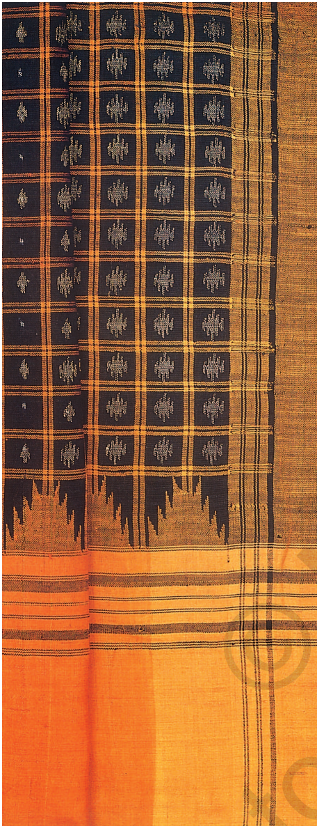
Fig. 5.10 Ikat weaving patterns such as this were adopted and modified at several coastal production centres in the subcontinent and in Southeast Asia.

➡ Why do you think Ibn Battuta highlighted these activities in his description?