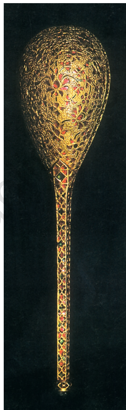
Fig. 5.12 A gold spoon studded with emeralds and rubies, an example of the dexterity of Mughal artisans

➡ In what ways is the description in this excerpt different from that in Source 11?