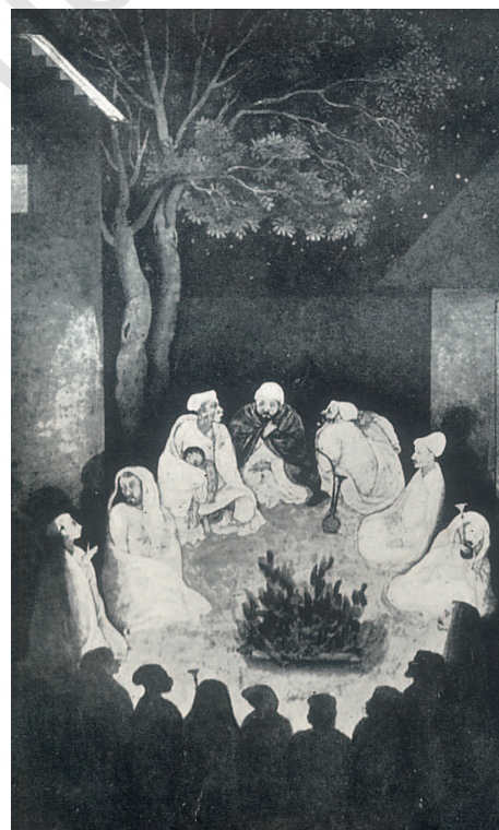
Fig. 5.5 An eighteenth-century painting depicting travellers gathered around a campfire

Among the best known of these writers were Abdur Razzaq Samarqandi, who visited south India in the 1440s, Mahmud Wali Balkhi, who travelled very widely in the 1620s, and Shaikh Ali Hazin, who came to north India in the 1740s. Some of these authors were fascinated by India, and one of them – Mahmud Balkhi – even became a sort of sanyasi for a time. Others such as Hazin were disappointed and even disgusted with India, where they expected to receive a red carpet treatment. Most of them saw India as a land of wonders.