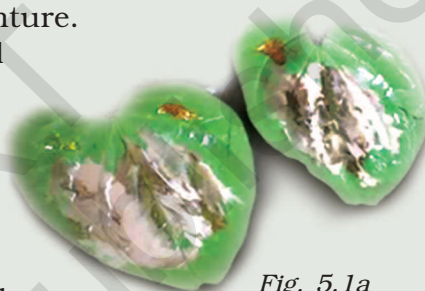
Fig. 5.1a Paan leaves

In this chapter we shall see how our knowledge of the past can be enriched through a consideration of descriptions of social life provided by travellers who visited the subcontinent, focusing on the accounts of three men: Al-Biruni who came from Uzbekistan (eleventh century), Ibn Battuta who came from Morocco, in northwestern Africa (fourteenth century) and the Frenchman François Bernier (seventeenth century).